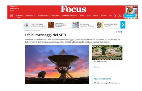
Fig. 3. A page of the Italian magazine Focus, telling about some possible massages received within the SETI project, which werent real ET signals.