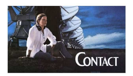
Fig. 6. The poster of the movie Contact, 1997, telling about the discovery of an ET signal with the Very Large Array of radio telescopes in New Mexico.

and troublesome topics, could anyway be interpreted as hiding something. Appearing within a big TV telecast as Voyager in Italy implied reaching two million watchers at once, explaining what SETI is, against the roughly five thousand people per year visiting the radio astronomical station. Nevertheless, the possibility of not accepting the visit of the presenter and the authors of the telecast has been