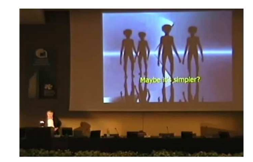
Fig. 1. Seth Shostack in Bologna in 2010.

involved in that research project. During all these years, we have faced some behaviours and beliefs that, according to us, can be pinpointed as the main risks of SETI research being misinterpreted or mixed up with something else.