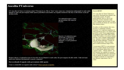
Fig. 7. The Hands-On Radio SETI exhibit at the visitor center of the Medicina radio telescopes.

largely considered, because of the reputation of the program (that would mean a lot of work of scrutiny and check-up of the contents) and in order to preserve the research infrastructure from the possible backfire of incorrect or equivocal communication. But this would have possibly meant being named during the episode as the ones that did not let us in, as if they are hiding something. Within the broad framework of the fear for a conspiracy, many people do believe that the discovery of a SETI signal would not be communicated to the public and would instead be kept secret, or even covered in lies<sup>2</sup>. The great advantage about